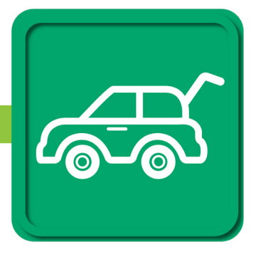
Pick up your items curbside