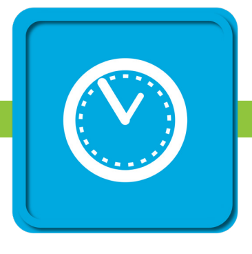
Book a time & branch location