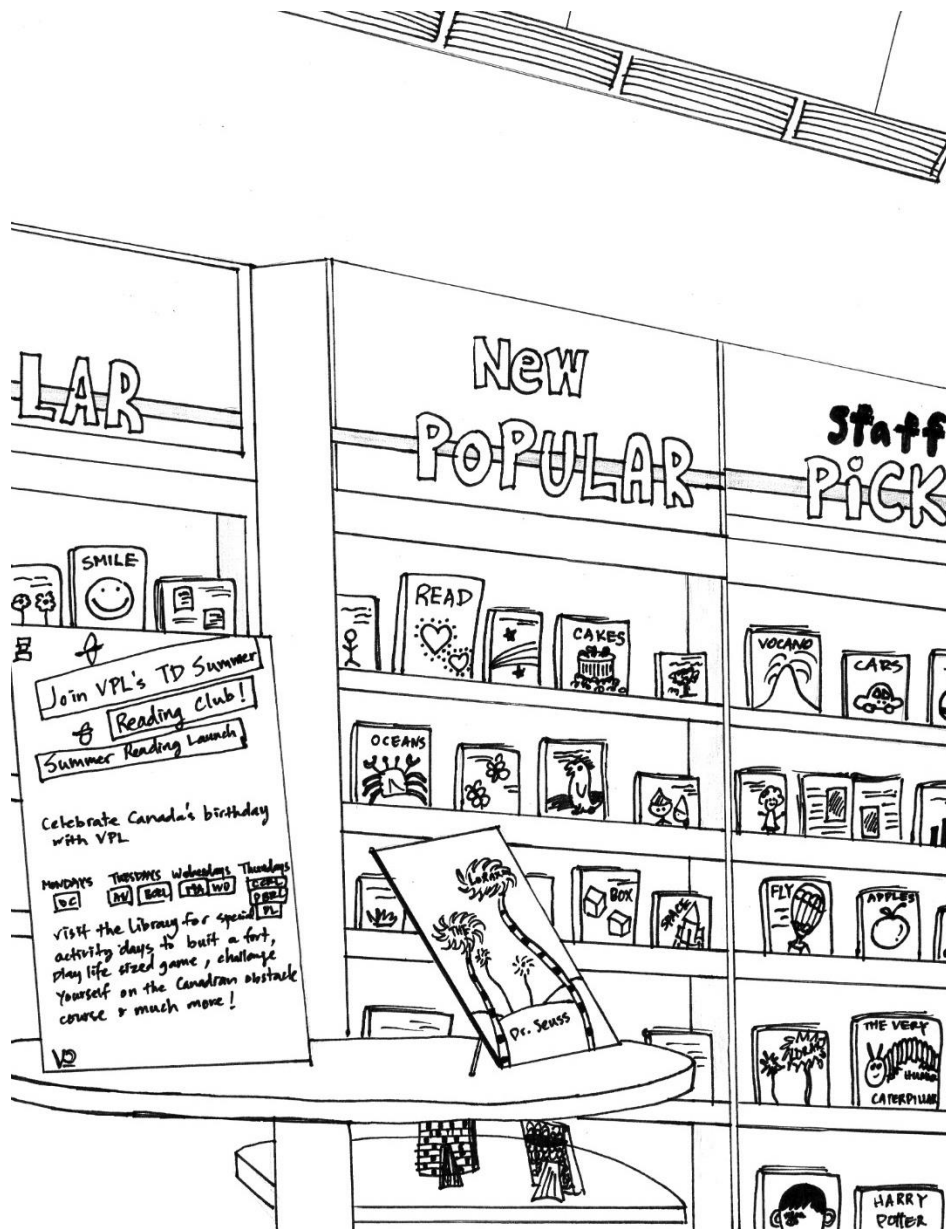
Drawing by Janice